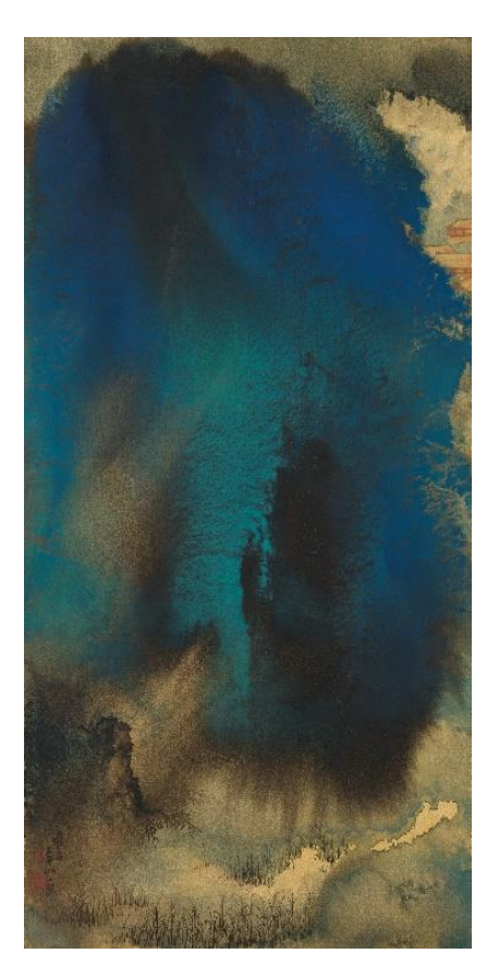
TOP LOT OF THE SALE SERIES Fine Chinese Modern and Contemporary Ink Paintings Zhang Daqian Temple at the Mountain Peak Price Realised: HK$209,100,000 / US$27,062,468

The leading highlight of the season is the magnificent Temple at the Mountain Peak by Zhang Daqian ( above ) which sold for HK$209,100,000 / US$27,062,468 , to become the second-highest price ever achieved for the artist at auction. It is also the highest auction price realised in five years for the artist, continuing Christie's leadership in bringing the finest works by Zhang Daqian to auction.